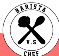
TABLE SERVICE UPON REQUEST